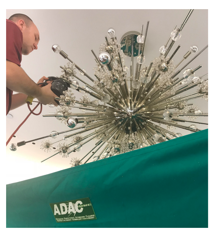
The equipment has a small footprint and minimal disruption.

This is our promise to you: Innovation - Quality - Sustainability.