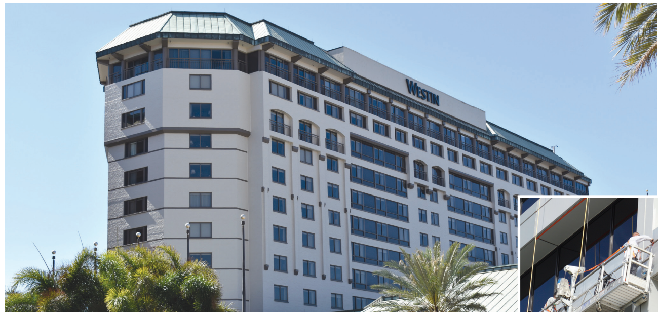
Field-applied APV Neverfade water-based Fluoropolymer High-Performance coating.

Glass Care – Stuart Dean polishes glass to remove corrosive etchings and restore its original finish.